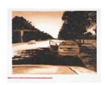
A STORY OF VIOLENCE, INJUSTICE, AND THE AMERICAN CITY